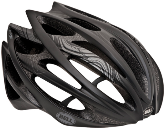
NEW! MATTE BLACK SWERVE