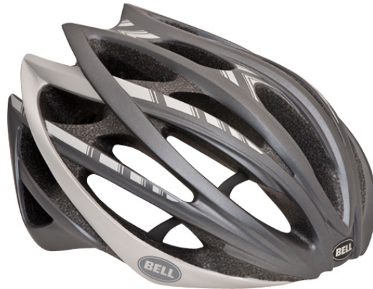
NEW! MATTE TITANIUM STRIPES