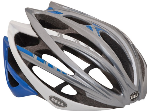
NEW! SILVER/BLUE STRIPES