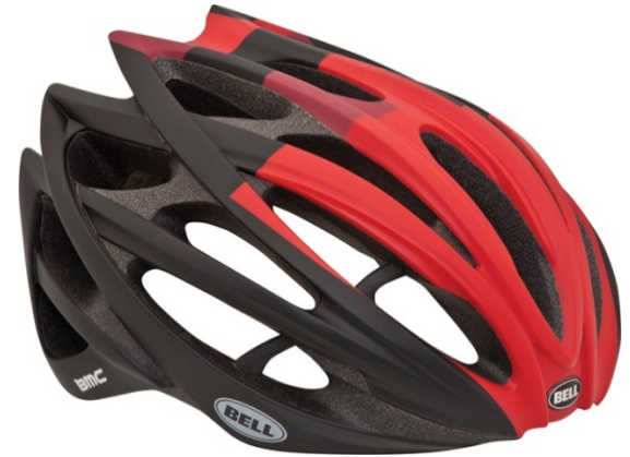
NEW! LIMITED EDITION BMC