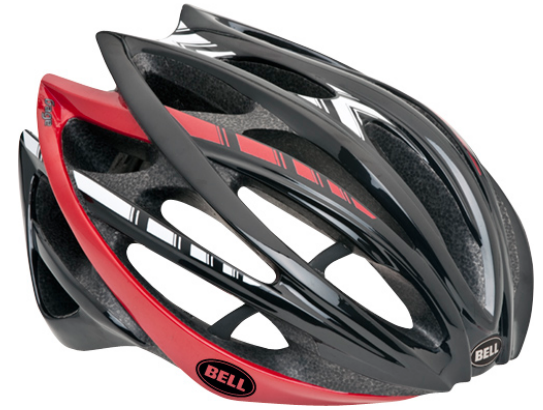
NEW! BLACK/RED/WHITE STRIPES