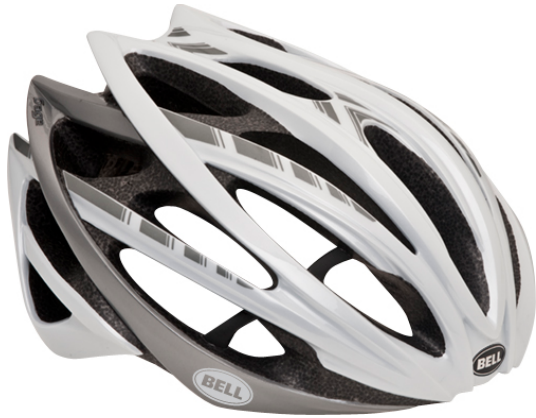
NEW! WHITE STRIPES